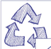
The "recycle" symbol.