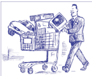
Cars, stereos, and VCRs can be 'energy smart'

Planting trees is fun and a great way to reduce greenhouse gases. Trees absorb carbon dioxide, a greenhouse gas, from the air.